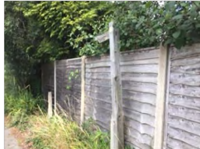
Post at southern end of path