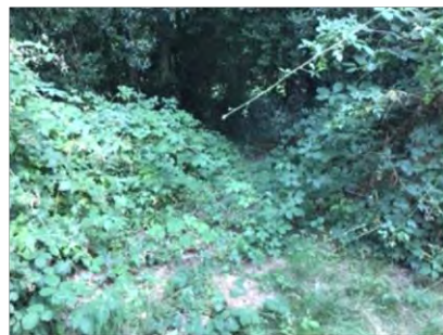
Brambles at Wingfield