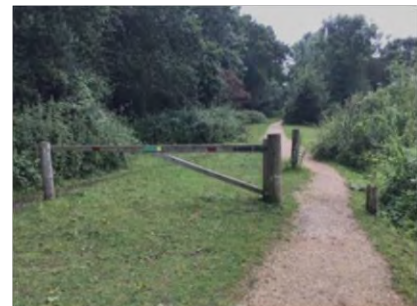
Forestry Commission gate