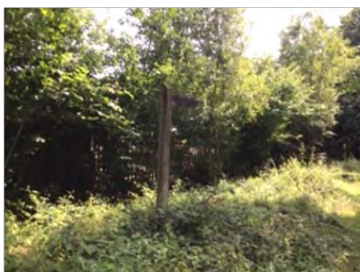
Post at western end of path