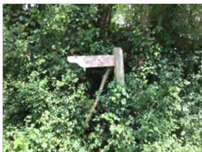
Finger post at Roselands