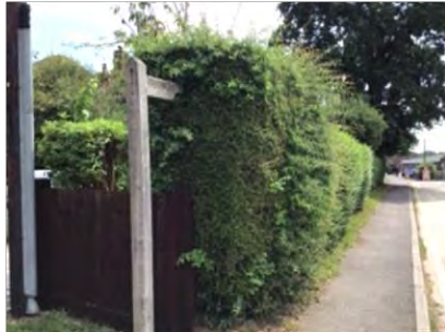
Post at northern end of path

This footpath is – at just 102m – the shortest in the Parish and is by far the easiest to walk, comprising as it does of a tarmac path running between the petrol station and Underoaks on Southampton Road, past the premises of M&J Mobility through to Old Lyndhurst Road. Finger posts at both ends are in good order, with no obstructions on whole length of path.