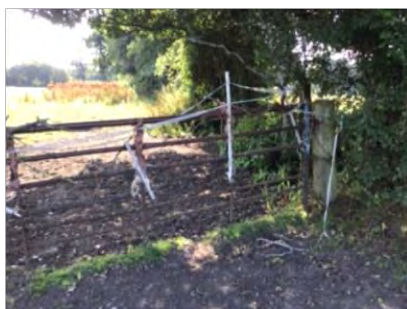
Gate obstructing access