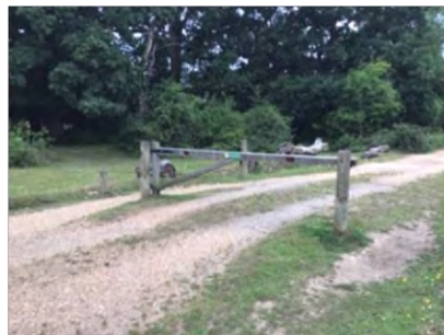
Forestry Commission gate