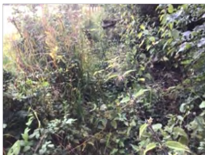
Vegetation on Netley Marsh section