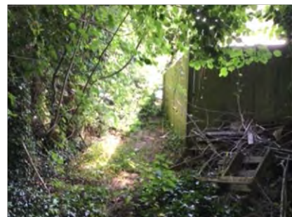
Behind 1 Rockram Cottages