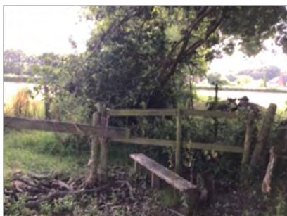
Stile at end of Copythorne path