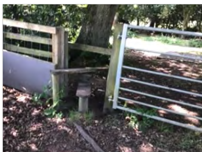
Stile at South end