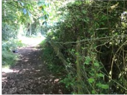
Fence issue in middle (facing E)