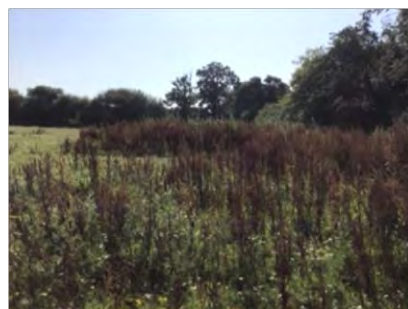
Path actually runs to RHS here