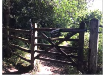
Gate at western end of path