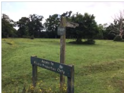
Post at eastern end of path

This bridleway, known locally as “Green Lane” runs for 989m. it is gravel underfoot throughout it’s length, wider in some places than others. Finger post at eastern end near Brookfield is in good order. Forestry Commission low barrier gates block vehicle access at two points along the bridleway. Finger post at western end behind Foundry House is also in good order.