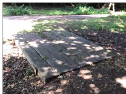
Bridge at South end