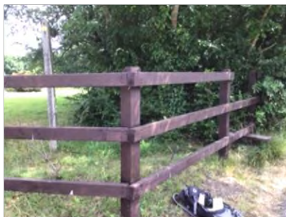
Stile & post at Wingfield

A short footpath of 128m that runs north east across the front garden on Wingfield Farmhouse before disappearing into a small area of woodlands behind 1 Rockram Cottages and Roselands. Whilst not marked across the garden the fingerpost in the garden of Wingfield Farmhouse directs you correctly to an area of woodlands. A pile of debris sits behind 1 Rockram Cottages (just off the footpath). A pile of logs and other items sits alongside Roselands (on the footpath). The fingerpost at Roselands is partly hidden. Debris issues may need to be dealt with once a planned HCC cut in August 2019 has been completed.