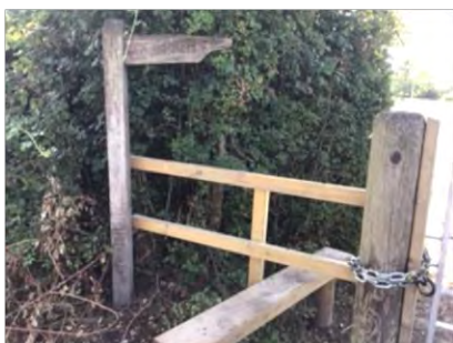
Stile & post, Chinham Road

Stile & finger post at start of this 261m footpath are in good order but unfortunately the recently replaced finger post is pointing in the wrong direction (SW rather than SE). No defined path across the first field to metal gate at entry to second field where there is no finger post or stile to assist. Path should run along RHS of hedgerow in second field but vegetation prevents using a direct route. Having reached far side of the second field at Parish boundary the stile is in good order but a partially fallen tree & heavy vegetation prevents continuation along Netley Marsh section of path. Issues affecting path in Copythorne will be relayed to HCC RoW team. Issues affecting path in Netley Marsh have been passed to their Parish Clerk.