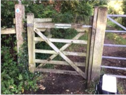
Gate at eastern end of path

This Bridleway starts as RoW Ref 166/17 within the Parish of Netley Marsh. It then becomes RoW 057/1 as it enters the Parish of Copythorne. It goes generally westwards for 637m until it reaches the New Forest boundary. Gates and signage at both ends are sound. Small section of fence, near the middle of the path has fallen slightly towards the path but this is not impacting use.