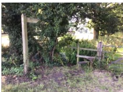
Stile & post at North end

This 128m footpath starts just to the west of the Coach & Horses pub and is accessed over a stile into an open field. Stile and finger post are in good order. There is a clear path across the field. At the far end there is another stile, in good order. A bridge of wooden railway sleepers, again in good condition, leads on to Path 18.