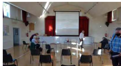
The Parish Hall ready to hold the June Council meeting.

The grass in front of this wall has gradually eroded with time and is now an area of very little grass where water collects when raining. It has been agreed to re-turf an area of 40m 2 to the side and front of the wall. In order to carry out this work, the area will be taped off for approximately three weeks to allow for the new grass to root. It is hoped to have the area back in use for the schools' summer recess.