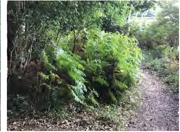
Vegetation at west end

Path 2 (Footpath 057/2) – Runs diagonally in a north-east direction from Wingfield Farmhouse to Roselands, at the south-eastern corner of Southampton Rd, Cadnam (128m long - SU2937 1359 to SU2947 1365)