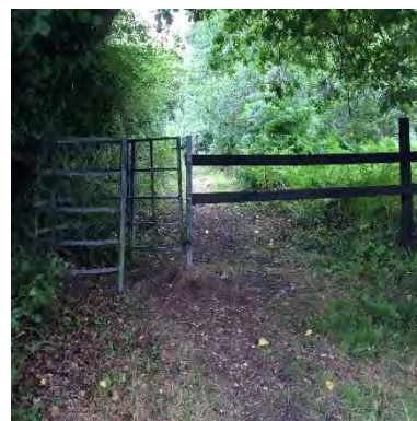
Kissing gate Vicarage Lane

Path 6 (Footpath 057/6) - Path starts at southwest corner of the Scout Hall field marked by a Right of Way post and ends just north of Brooksbank on Pound Lane (305m – SU3079 1470 to SU3107 1476)