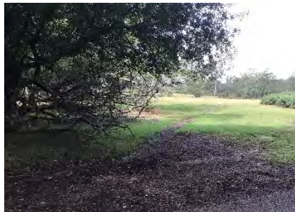
End point on Cadnam Lane