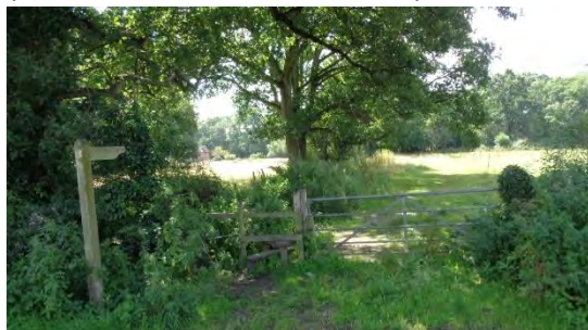
Southampton Road end of path