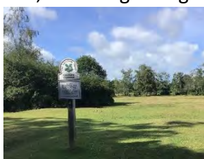
End near Cadnam Common Road