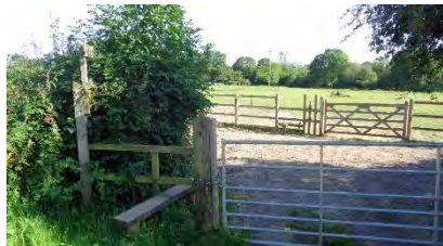
Chinham Road end

CLERKS NOTE: Vegetation on route and broken stile reported to HCC Countryside Service