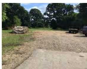
Start at Storms Farm

One of our newest “RoW” confirmed in 2008. This Restricted Byway (for pedestrians, horse-riders, cyclists and horse-drawn carriages only) starts at Storms Farm where the tarmac road ends and heads broadly east -north-easterly on open land onto Cadnam Common. The path is not easily seen in places but there are no issues to its use. No stiles, footbridges or gates. (D Rigby, Clerk - 24/8/21)