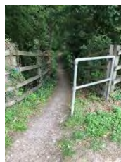
View down path

Path 504a (Restricted Byway – 057/504a) Runs from the eastern end of Storms Farm Road to the junction of Cadnam Common Road & Cadnam Lane. (695m – SU2892 1490 to 2956 1516)