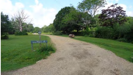
Eastern end – Beechwood Road

CLERKS NOTE: Broken finger post reported (again) to HCC Countryside Service