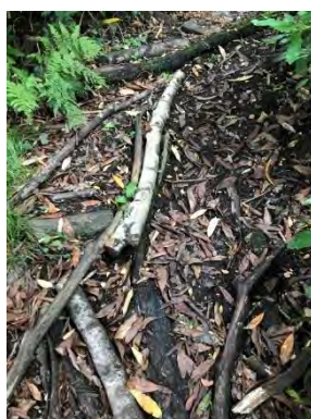
Logs used to stabilise ground