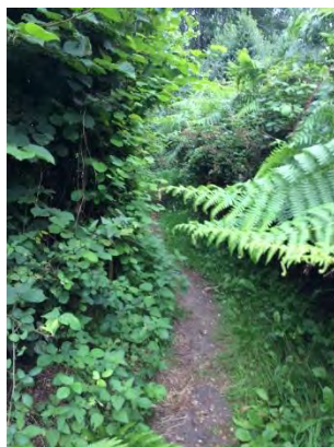
Middle section of path