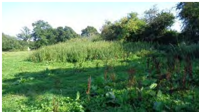
Vegetation on route