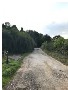
Brickly Lane at Home Farm