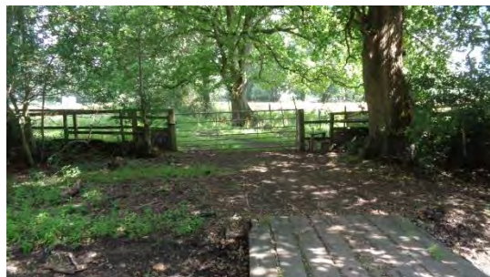
Looking back towards Southampton Rd

Path 9 (Footpath 057/9) - Runs north from Romsey Road (adjacent to Uncle Tom's Cabin) to Cadnam Common, Cadnam Lane.