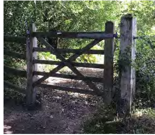
Gate at west end