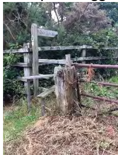
Newbridge Road Stile