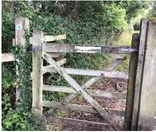
Gate at east end