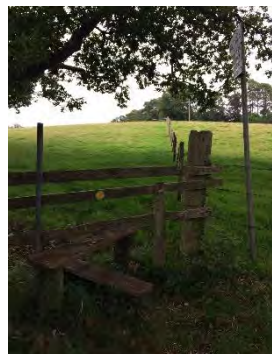
Stile behind school

CLERKS NOTE: I walked this path in full in mid September 2021. No issues.