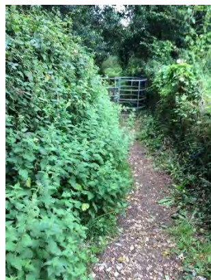
Kissing gate behind church

CLERKS NOTE: Path has since been cleared by Parish Lengthsman