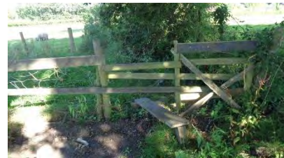
Broken Stile at eastern end

Path 8 (Footpath 057/8) - Runs South from just west of Coach & Horses PH on Southampton Road to join Path 18