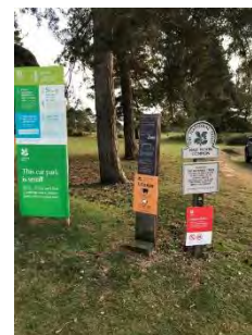
Car park signage

Path 12 (Footpath 057/12) - Starts on north side of Romsey Road heading north west to then run west parallel with M27 until it reaches Newbridge Road (just before motorway bridge)