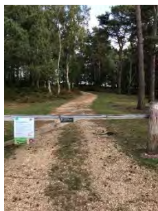
Car Park, Blackhill Road