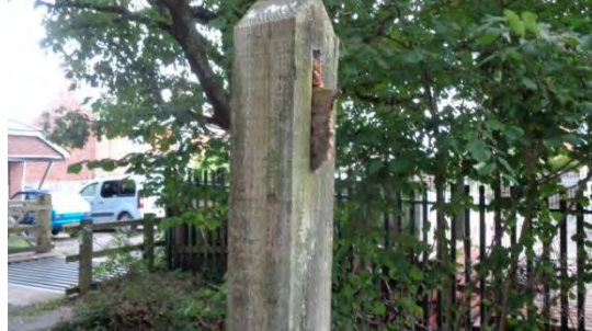
Broken Finger post at Cadnam end

Path 501 (Footpath 057/501) - Runs east from Furzley Road (near Crook Hill) and ends at a footbridge which crosses the Cadnam River behind Newbridge House, where it joins Bridleway 502. (450m - SU2936 1543 to SU2979 1555)